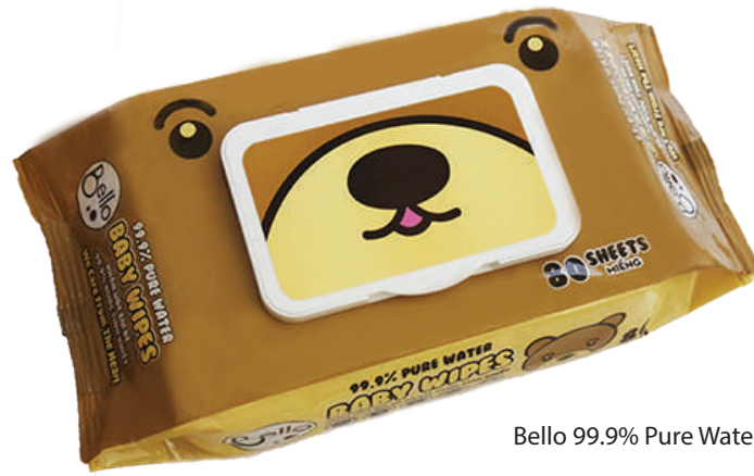
Bello 99.9% Pure Water Baby Wipes 80s (BE3973)

99.9% Pure Water Baby Wipes, the simplest formula for an effective yet soft and gentle clean for newborn babies. Our advanced 6-stage water purification system comprising of USA-made dual membrane (micro-filtration and reverse osmosis) and ultraviolet technologies ensures all water used in our products attained the highest purity.