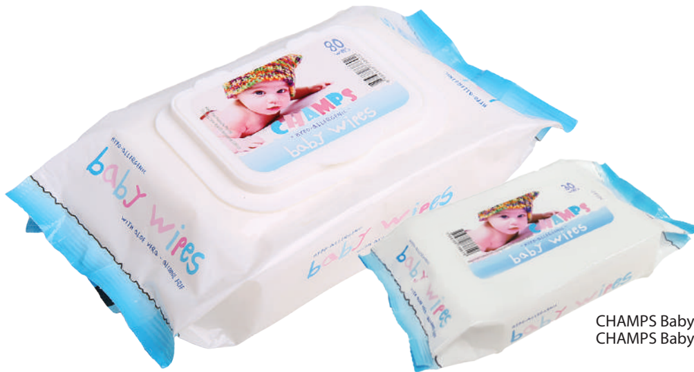
CHAMPS Baby Wipes 80s (CP3860) CHAMPS Baby Wipes 30s (CP3861)

Champs baby wipes are made from soft and strong nonwoven material. Each wipe is enriched with natural aloe vera extracts to soothe baby's sensitive skin and maintain skin hydration. This premium range of baby wipes are hypoallergenic and alcohol-free. Available in packs of 30 sheets pack with re-sealable seal, and 80s Pop-Up packs with Snap-Shut plastic lid provide greater ease for frequent usage.