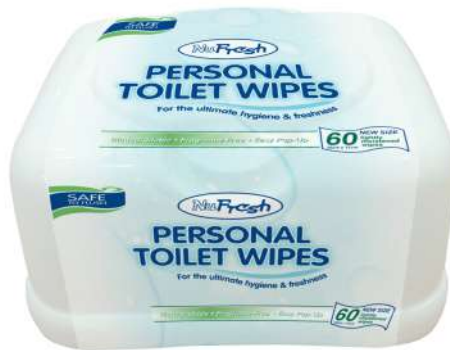
NF3904 NuFresh Personal Toilet Wipes (Tub) 60s