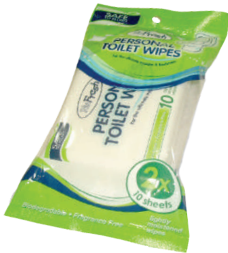
NF3848 NuFresh Personal Toilet Wipes 2 x 10s