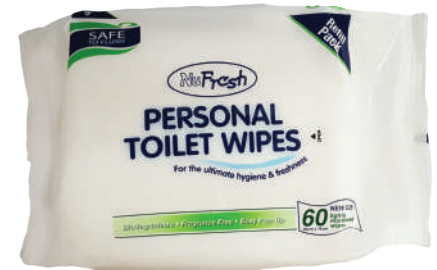
NF3903 NuFresh Personal Toilet Wipes (Refill) 60s

NuFresh Personal Toilet Wipe are made from hydro-entangled nonwoven which are water-dispersible and hence bio-degradable and flushable. Already premoistened and ready to revitalized, these flushable toilet wipes provide an enhanced every day clean and contain mild cleansing agents, aloe vera and chamomile extracts. It is a cleaner clean than using dry toilet paper alone, use NuFresh Personal Toilet Wipes in addition to toilet paper to effectively clean and eliminate any unwanted residue and remove odour-causing bacteria. For best flushability, use only one or two wipes per flush.