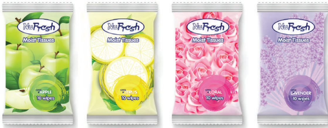
NuFresh Moist Tissue 10s Apple (NF3948), Citrus (NF3945), Floral (NF3946), Lavender (NF3947)

Our durable, all-purpose moist cleansing tissues come in a convenient size to tuck away in purse, handbags, desk drawers and more. NuFresh Moist Tissues provide a convenient way to clean and refresh your skin when soap and water are not available. The moist tissues are soft and strong, alcohol-free and are available in bulk packaging of 4 packets of 10 sheet pocket-pak per set. The re-sealable pack with secure closure keeps wet wipes moisturized for longer use and more value.